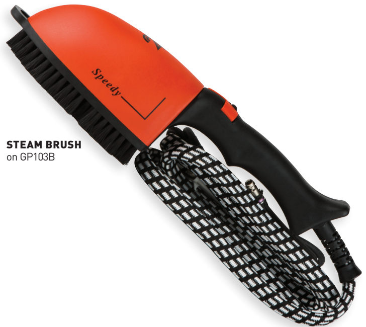
STEAM BRUSH on GP103B