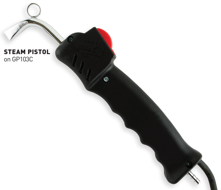
STEAM PISTOL on GP103C